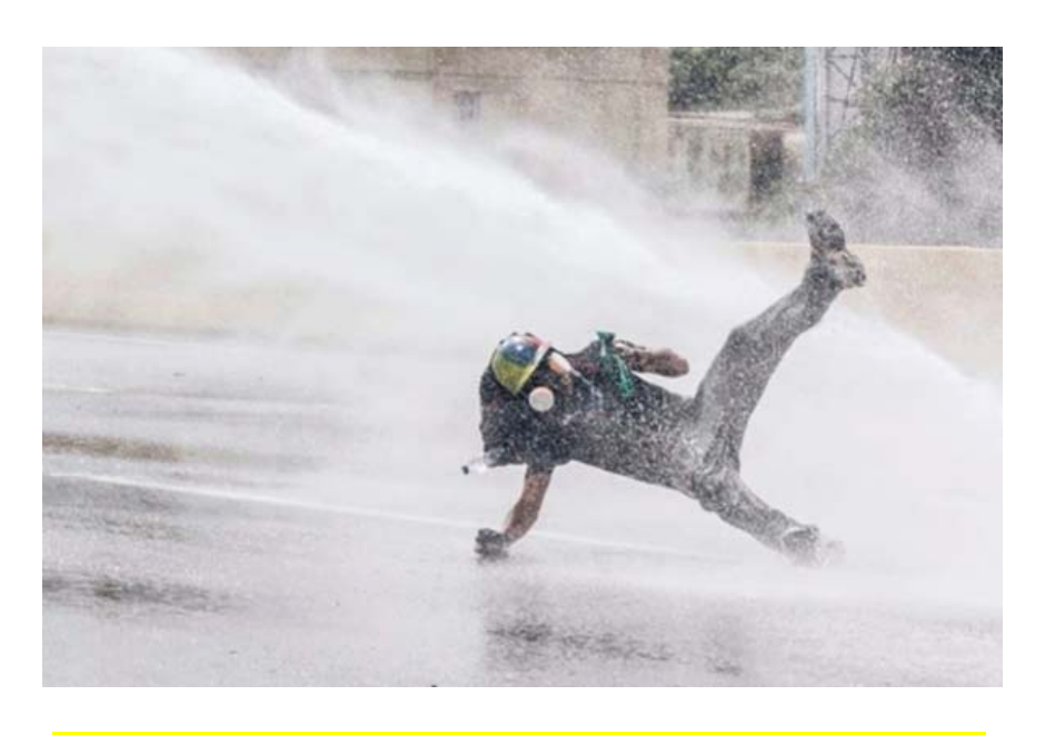
"waterproof; he rose again with his purpose undaunted."