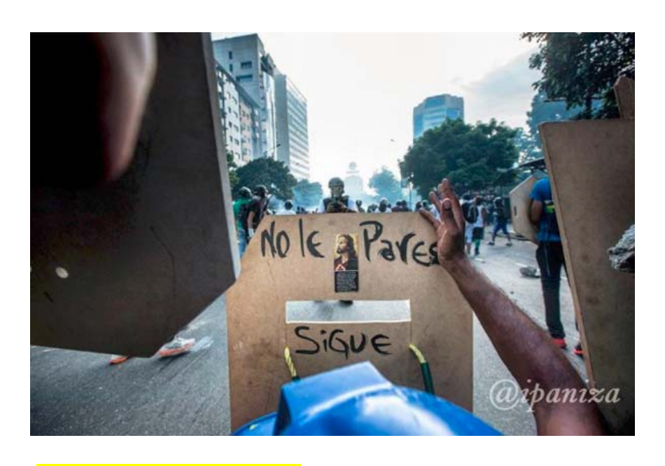
"don't stop / keep going." A photo by Isaac Paniza taken on April 20th in the Chacaito neighborhood of Caracas. // instagram.com/p/BUX0raWDzqW